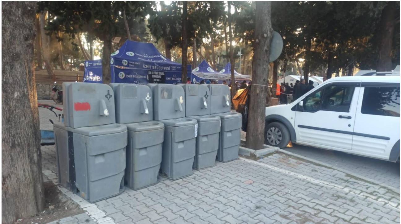
Handwashing units are installed in multiple points in Defne. STL WASH program is being rolled out across the affected region

Contagious diseases, infections and spread of lice are being reported in central locations. In addition to scabies (reported earlier), another viral disease with symptoms of fever is reported. Large amounts of food parcels and hygiene kits are reaching the area, but the needs are significant and food security risks continue. Several child-safe spaces are established. World Human Relief is providing psychological support since the early days.