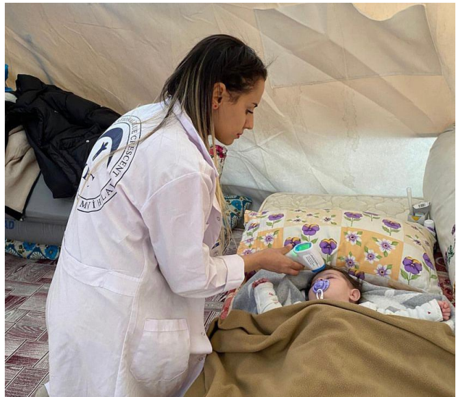
IBC begins a mobile medic team with nurse and support of Action Medeor in Islahiye/Gaziantep

Also, today IBC Field Team did site visits with partner Muslim Charity in Nurdagi and Islahiye/Gaziantep, then to Kirikhan/Hatay to see the site designated for the container city and the planned caravans currently being mobilized from other IBC project sites. Photographs were taken and IBC field staff participated in an interview. In Kirikhan, the land allotted to IBC by the coordinating Governor and District Governor for the establishment of a container city was measured and upon realization of a larger surface area than originally discussed, further social activities will be planned in addition to the living facilities. Since we have received some support for the container city in Kirikhan to start, we expect the container city to begin forming gradually within the next two weeks and the more funding secured, the more containers can be installed and solve the living problem for the suffering earthquake survivors of Kirikhan. The land allotted can fit nearly 500 containers where 1 family lives in each container that includes a basic design of 2 rooms and a toilet. In these camps according to IBC's previous experience, some services that can be provided include laundry service, garbage collection, child-friendly spaces, and psycho-social support services.