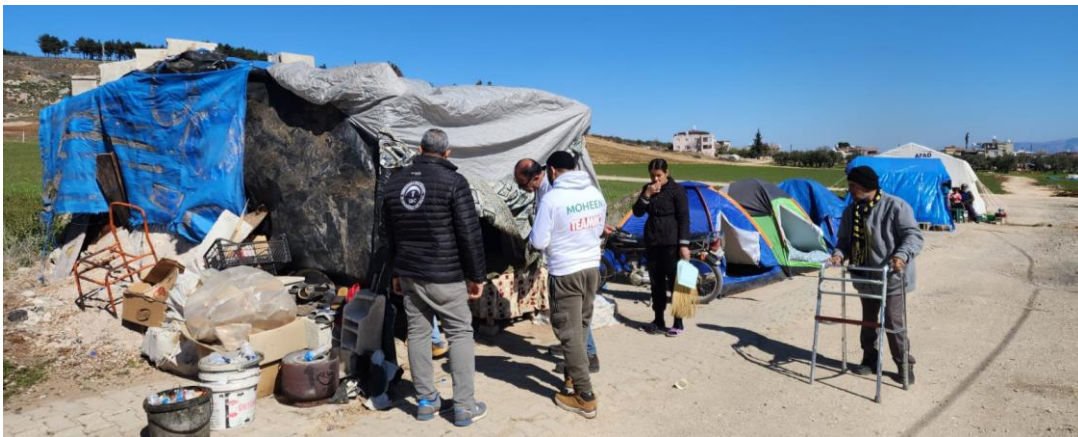
IBC Field Team with Partner Muslim Charity examining the situation for earthquake victims in Gaziantep

Following the earthquakes and reported 4,734 aftershocks 6 , many frightened earthquake survivors, including IBC staff, continue to sleep in their cars for fear of safety and lack of adequate shelter in the frigid February winter. In Türkiye, engineers are evaluating the safety of remaining buildings. In the regions affected by the earthquakes, damage assessment studies were carried out on 2,196,088 independent units in 481,865 buildings. It was determined that 263,800 independent units in 61,722 buildings assessed for damage were in urgent need of demolition. According to the written statement made by the Ministry of Environment, Urbanization and Climate Change, 15,248 buildings in Hatay, 12,980 buildings in Kahramanmaraş and 12,964 buildings in Gaziantep need to be demolished urgently. More than 7,000 experts, including 400 professors and associate professors from more than 20 universities, and many volunteer civil engineers, will continue their work in the earthquake zones until all areas have been adequately studied. Meanwhile ACU’s latest report shows the number of buildings totally destroyed in Northwest Syria as 1,793 and number of partially destroyed buildings as 7,985 with the most affected areas being Harim and Jisr-Ash-Shugur/Idleb and Afrin and Al-Bab/Aleppo.