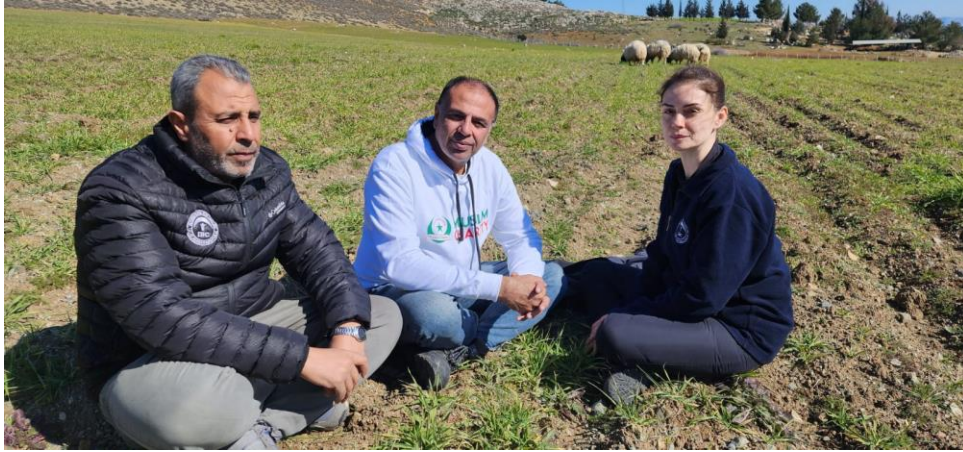
IBC Field Team meets with Muslim Charity to discuss developments in Kirikhan/Hatay