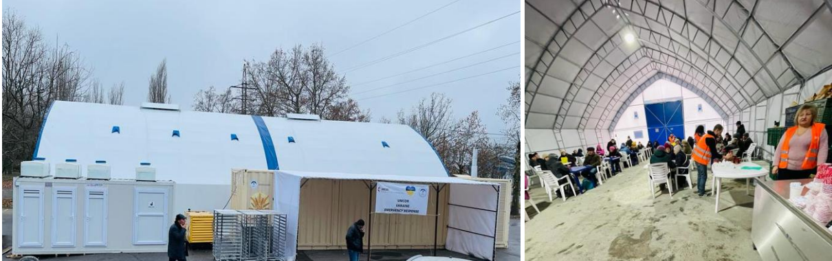
IBC community tents being developed in 6 locations, here is an example of the ones set up in Ukraine and Moldova

villages and are planning to visit Adiyaman and Sanliurfa Suruc district in the coming days for further assessment.