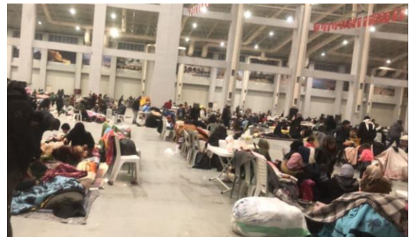
Food, blankets, basic needs in Sanliurfa Exhibition Center