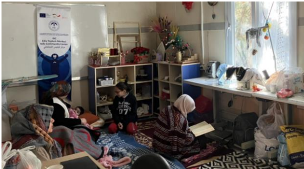
Sheltering in IBC Kilis Community Center

Action Medeor, Bridge, Conrad L. Hilton Foundation, Corus International, Decathlon France, Give2Asia, GIZ, GlobalGiving, IDRF Canada, IMC, JDC, MSF, Muslim Charity, Solvay, Together Rising, UMCOR, WHH, World Jewish Relief