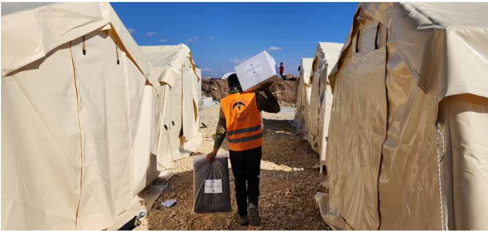
IBC Cross-Border Team delivered food and blankets to 1,800 earthquake survivors this week

After Antakya, which is the central district of Hatay, Kirikhan is the district with the most destruction and death. IBC Field Staff in Hatay commented that even the debris removal operations have not yet begun. IBC Field team while in Kirikhan discussed together with partner Muslim Charity and local stakeholders the effects of the earthquake, the urgency of the need to begin activities and building, the organization of the container city, the community tent, hot meals, and plans to provide psychosocial support. Tomorrow the work of leveling the land will begin to prepare for containers in Kirikhan and mapping of caravan locations will be more clear, the aim is to make it accessible around Kirikhan and Antakya where there were Turkish, Syrian, and Afghan families. At the end, a few IBC team members went to Antakya/Hatay and in the evening returned to Kilis to close the day. After completion of distribution of food and blankets to 1,800 people the two days before which were supported by partners IDRF Canada and Action Medeor, activities will resume in Northwest Syria in the next days. The Cross-Border team looks to develop hot food delivery through a mobile kitchen, similar to the services developed/developing in Türkiye locations.