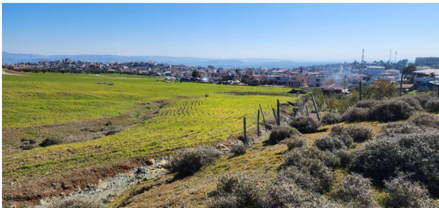
Land allotted to IBC by Kirikhan/Hatay Officials to set-up a container city (camp)