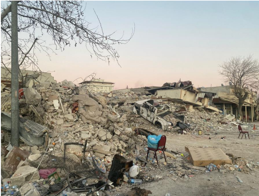
IBC Field Team visited Nurdagi/Gaziantep multiple times this week

personnel working in the region is reported as 264,389 , together with the number of field personnel assigned in the field, including AFAD, Police, Gendarmerie, MSB, UMKE, Ambulance Teams, Local Security, Local Support Teams and 9,908 volunteers. Disaster Working Groups have been formed especially around the themes of shelter, nutrition, and psychosocial support. AFAD reports that 386,874 tents have been shipped by ministries, relevant institutions and organizations and international countries and organizations, of which 172,265 have been set up. Mobile Kitchens, hot meals, soup, bread, water, and other food items were emphasized since the first days and most people in the disaster zones have access to these regularly by now. Lastly, nearly 500,000 earthquake survivors have been provided with psychosocial support in the last two weeks, but there is an urgent call for scale up by all NGOs in the field in addition to taking care of the most vulnerable women, children, elderly, and persons with disabilities' protection needs when planning and implementing programs for the earthquake survivors.