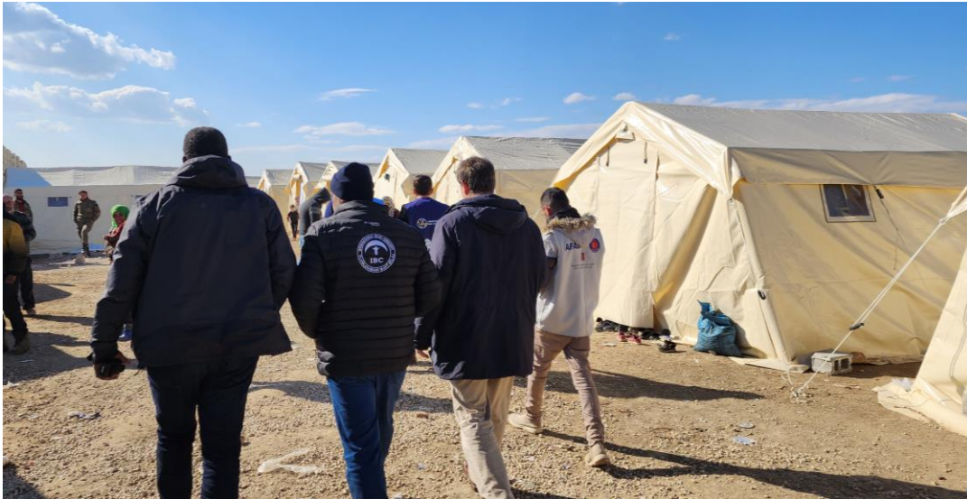
IBC Cross-Border Field Team evaluates a camp in Northwest Syria with AFAD and local officials

At least 45,463 people have lost their lives so far in the February 6 th earthquakes with 7.5- and 7.8-magnitude on the Richter scale just hours and kilometers apart in Southern Türkiye just twelve days ago. As of this afternoon, Minister Suleyman Soylu updated the death toll in Türkiye to 39,672 1 meanwhile the United Nations Office for the Coordination of Humanitarian Affairs (OCHA) reported two days ago that 5,791 2 people have died in Syria (Assistance Coordination Unit (ACU) reports 4,518 in Northwest Syria alone as of today) 3 . According to experts, the number of casualties is likely to climb significantly, especially as recovery and clean-up is moving slow or has not even begun yet in some of the hardest hit areas of Kirikhan and Antakya of Hatay and Islahiye and Nurdagi of Gaziantep among other areas in the earthquake zone. Local organizations on the ground in Syria report that many of the hardest hit areas in Northwest Syria have not been able yet to conduct full search, rescue, and recovery. Further, the injuries reported in Türkiye have reached 108,068 and 216,347 disaster victims were reportedly evacuated from the region to other provinces. 4 In