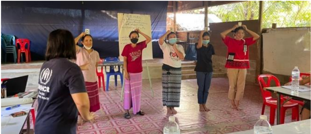
Engaged Men in Accountable Practices (EMAP) activities in – Ma Ra Ma Luang camp, 25 October 2022. The activity was about "understanding the status". Each participants held a game card without knowing what number they were holding. The rest of the participant would go up to each one of them and greet them according to the card they were holding. The person who held the highest number would be greeted with respect, while the person who held the smallest number would be ignored.