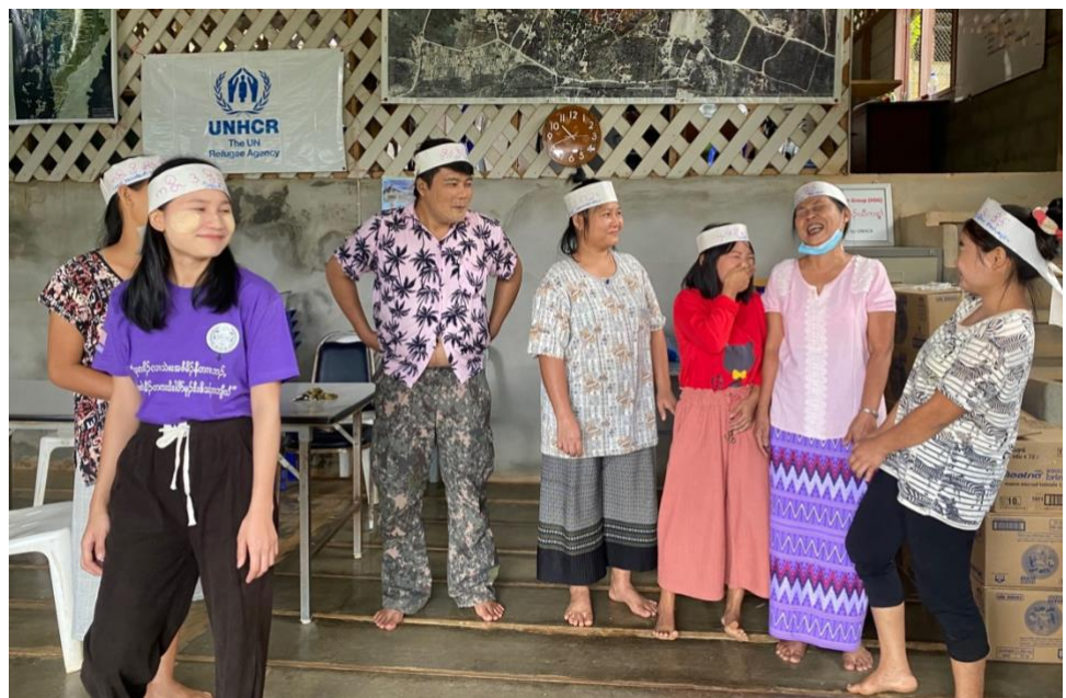
Engaged Men in Accountable Practices (EMAP) activities in –Than Hin refugee camp, 1 December 2022. The training included 10 females participants attending sessions twice a week. Here, participants are doing role play on power and status to better understand the impact of gender norms.

1 Multi-Country Office in Bangkok 2 Field Offices in Mae Hong Son and Mae Sot