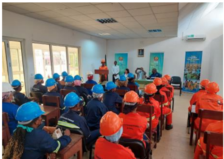
IFPELAC students in action.