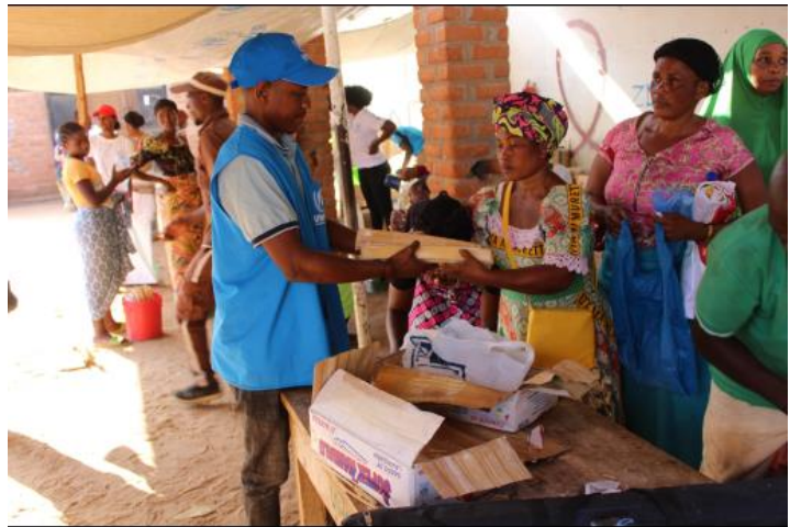
Distribution of CRIs to refugee residents of Maratane Refugee Settlement.