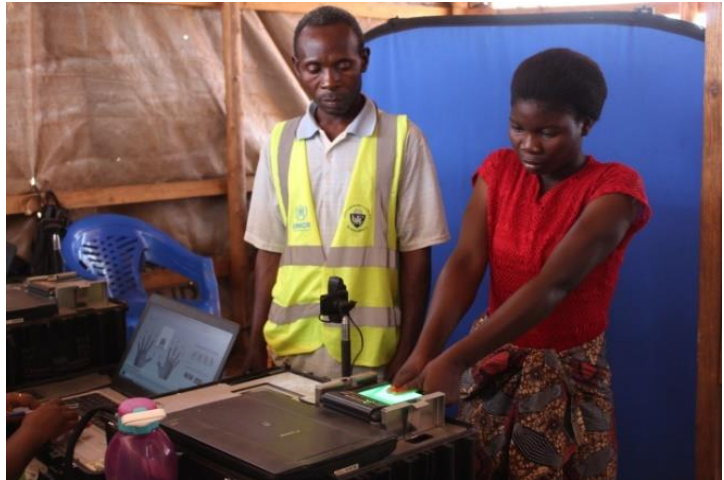
Mobile clinic providing civil documentation to displaced people in Corrane IDP Site, Nampula.