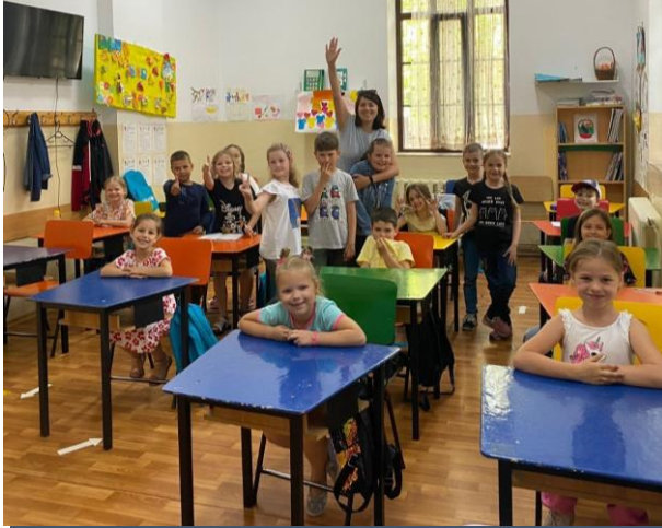
Activities organized in the Education Hub at School 11 in Constanta, May 2022.

promote social cohesion by bringing Ukrainian children in close contact with their Romanian peers and to allow parents to participate in the labour market while their children are attending schools.