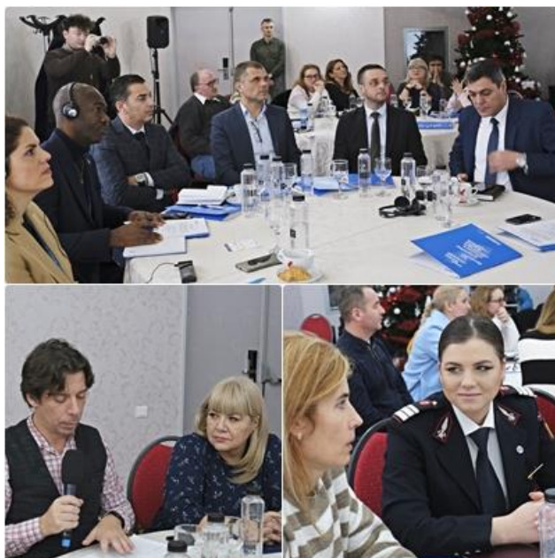
Refugee support coordination network meeting in Constanta, 14 December 2022.

Since 24 February 2022, about 7.9 million people have sought refuge from Ukraine across Europe. As of 25 December 2022, more than 2,5 million border crossings from Ukraine and Moldova into Romania have been recorded by GII, with some 106,629 people choosing to remain in the country. Around 102,039 Ukrainian and Third Country Nationals (TCNs) have obtained temporary protection, which enables access to healthcare, education, and the labour market. Most refugees are staying in large cities such as Bucharest, Constanta, and Brasov.