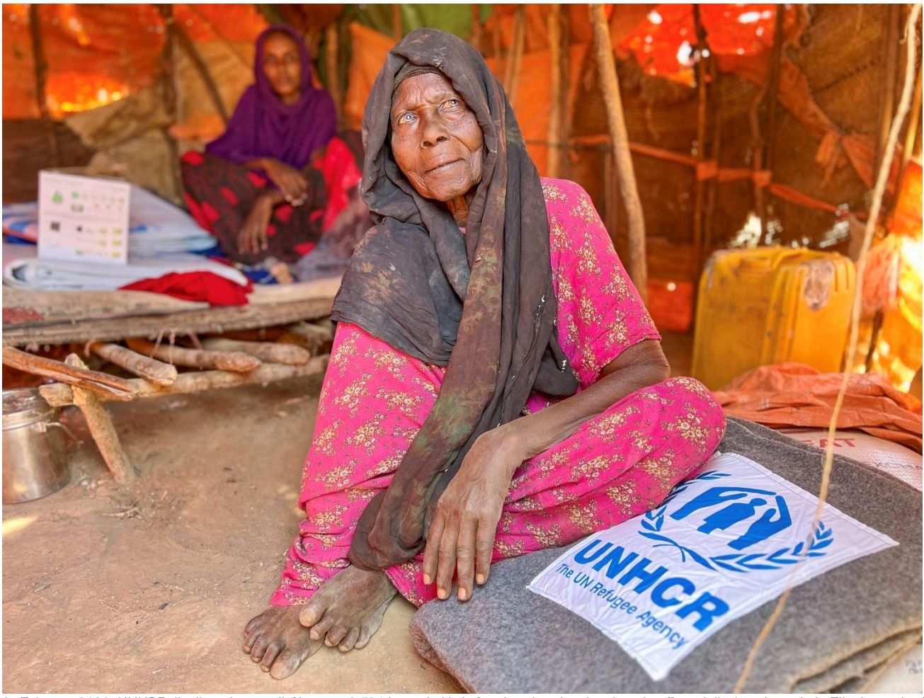
In February 2023, UNHCR distributed core relief items to 2,521 households in four locations hosting drought-affected displaced people in Elkeri woreda of Afder zone, Ethiopia.

The risk of gender-based violence (GBV) has increased as women and girls are forced to travel a distance to fetch water and meet basic needs while children are also being left alone in the IDP sites as family members are away looking for food or livelihood. Among five one stop center for GBV survivors in the zone, only one is providing limited services due to shortage of resources.