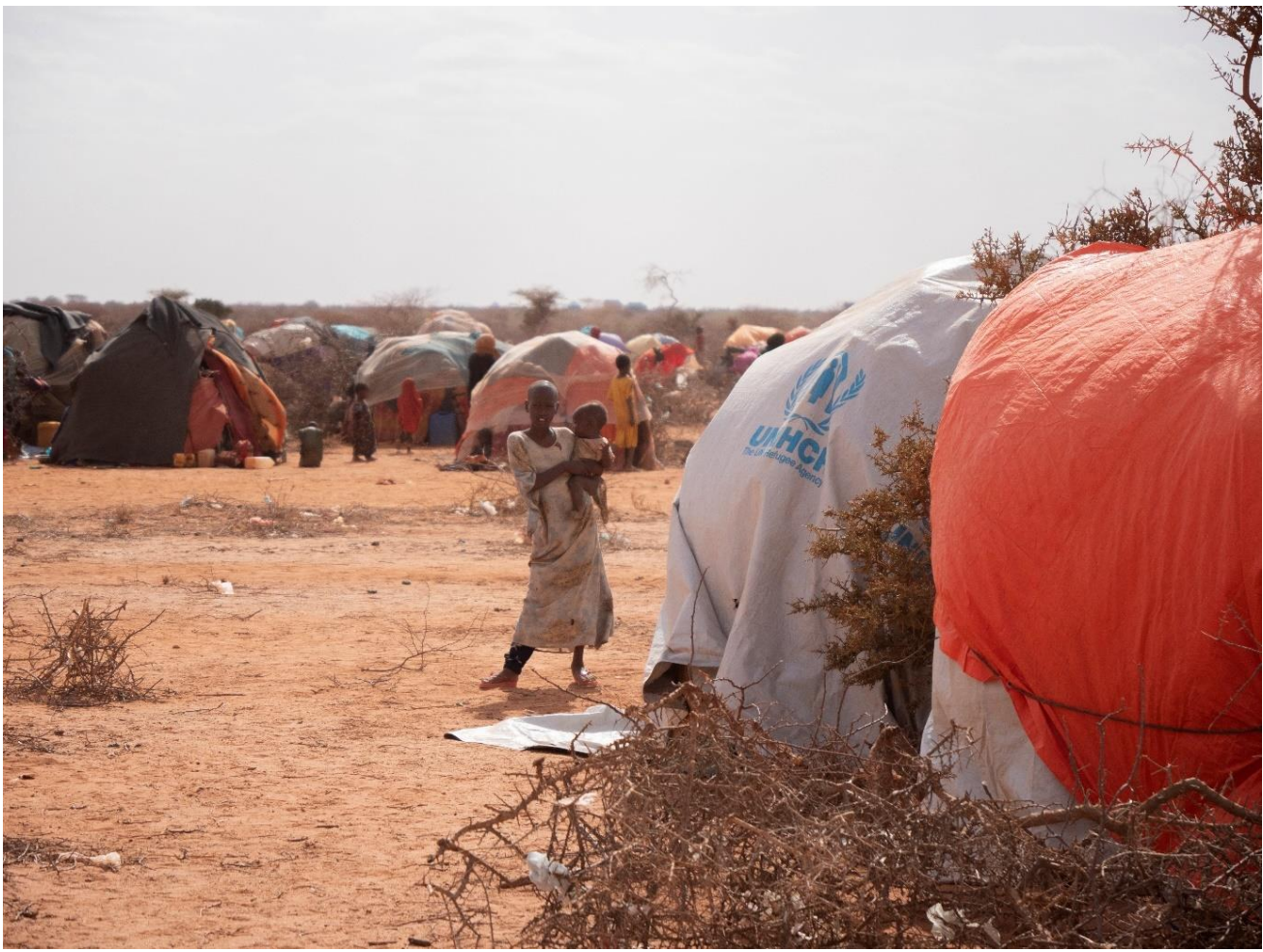
Families shelter at the Ladan site for internally displaced people in Dollow, Somalia. The catastrophic drought ravaging the country is putting communities on the brink of famine, with many thousands having been forced to flee their homes in search of food, shelter and safe drinking water.

The Camp Coordination and Camp Management (CCCM) Cluster partners conducted 235 site-level stakeholder coordination meetings in Dinsoor, Hudur, Afgoye, and Qansax dhere, all in South-West State, and discussed service delivery and advocacy for drought-displaced new arrivals. In addition, partners held site-level meetings with camp management committees (CMCs) and community members in Garowe, Qardo, and Bossaso in Puntland to allocate space to construct shelters and facilitate access to existing services for the newly displaced population.