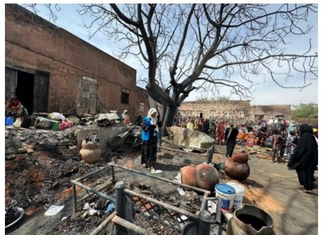
Assessment was conducted after the fire that had broken in West Darfur.

Several reports of fire incidents in various locations were reported, in part due to the strong winds experienced during this period (March – May). Fires broke out in the Salahuddin Ayobi IDP gathering site in El Geneina (West Darfur), Drissa donkey water yard, Ali Salam IDP return area (South Darfur), El Neem IDP camp, and Al Muhajeria (East Darfur). Sadly, six children, five in Drissa donkey water yard and one in El Neem IDP camp, lost their lives in the fires, and more than 1,500 shelters were destroyed. The Site Management Working Group has planned to conduct an assessment to determine multi-sectoral needs and enable verification of a pre-existing WFP list from six months ago to facilitate the provision of NFI assistance to those affected.