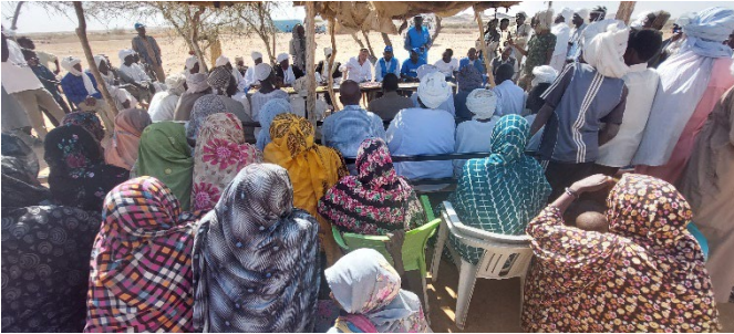
UNHCR met with hundreds of returnees returned to their localities

A joint UNHCR / North Darfur Government delegation mission to the North Darfur localities of Tina, Kournoi and Um Barou revealed that thousands of refugees and IDP returnees have come back to their areas of origin over the last few years. While some returnees move back and forth in pendular movements, particularly during the agricultural season, UNHCR met with hundreds of returnees who are seeking to rebuild their lives in the three localities. In subsequent meetings with North Darfur State Ministries, it was agreed that relevant UN agencies