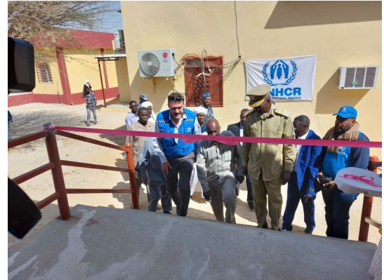
The opening of Tina hospital and handover of 2 schools in Tina and Kournoi localities in North Darfur state.

UNHCR handed over a newly constructed, rehabilitated, and equipped hospital to local authorities in Tina locality, North Darfur, as well as two schools in Tina and Kournoi localities. The ceremonies were part of a joint UNHCR / North Darfur Government visit to the region to ascertain the status of refugee and IDP returns to the area.